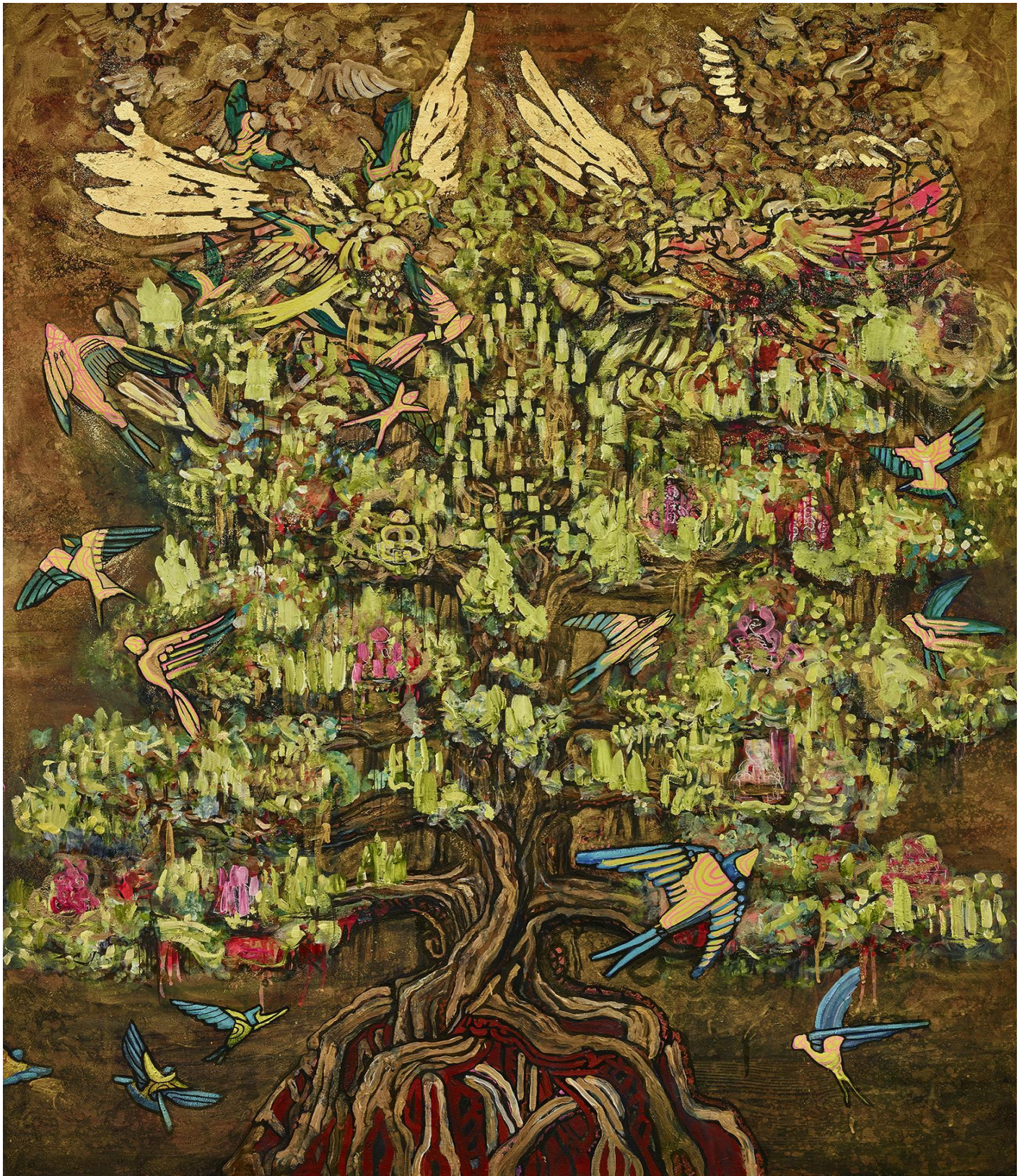
Title Tane Mahuta Life Tree Medium Acrylic Metal Flake and Resin on Canvas Size 152cmw x 120cmh Framed Price $45000 USD