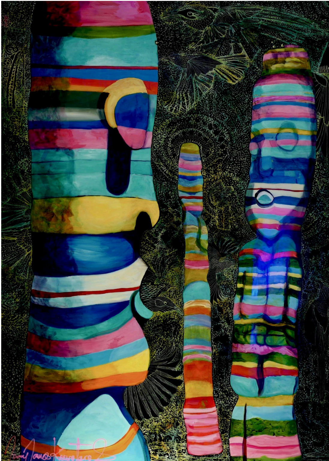
Title Waiata O Nga Whetu Medium Acrylic and Resin on Canvas Size 1170w x 1720h Framed Price $45000 USD

This ancestral figure reflects the celestial colours of the southern night sky and shows him as a way finder guided by the dots of lights printed on the dark night skies. In Māori culture, Tohunga could read the star maps and chartered the heavens to navigate the open highways of our pacific ocean. Further, karakia was used to keep the faith and heart strong and to please the gods especially Tangaroa (God of the Sea) and Tawhirimatea (God of the Winds). All these elements are reflected in this sculpture and he is named after one of the very first navigators to Aotearoa.