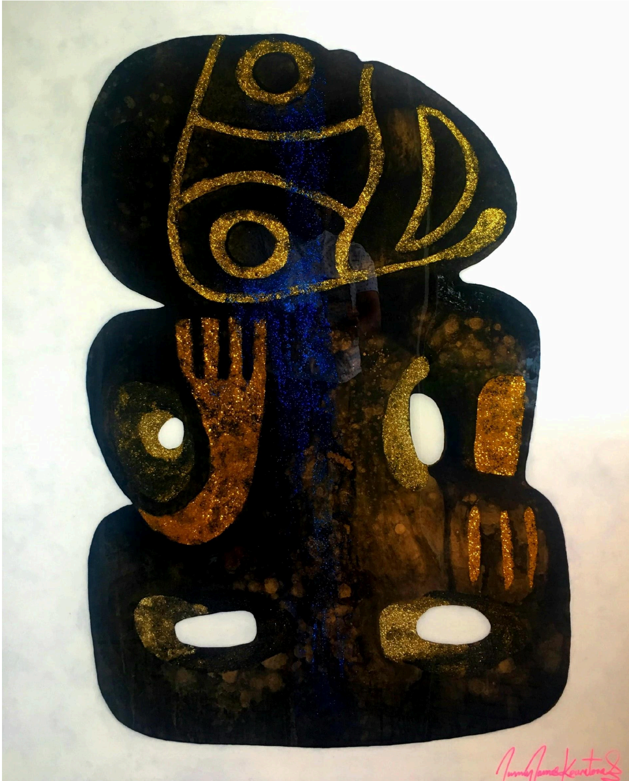
Title Tangi Aroha Medium Acrylic, Metal Flake and Resin Canvas Size 120cm x 164cm Framed Price $ 36000 USD